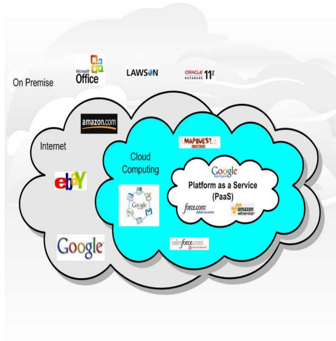
Fig. 1. Service providers and Clients utilize Cloud Computing

Most cloud computing infrastructures consist of services delivered through common centers and built on servers. Clouds often appear as single points of access for all consumers' computing needs. Commercial offerings are generally expected to meet quality of service (QoS) requirements of customers, and typically include SLAs.