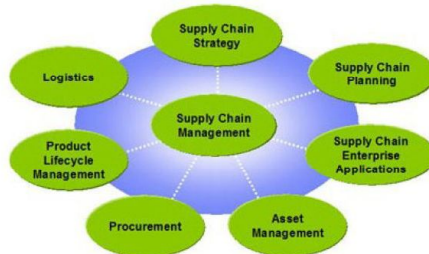
Figure:-2 Simplified supply chain network structure

Another source defines supply chain as, the network of entities through which material flows. Those entities may include suppliers, carriers, manufacturing sites, distribution centers, retailers, and customers (Lumms and Alber, 1997).