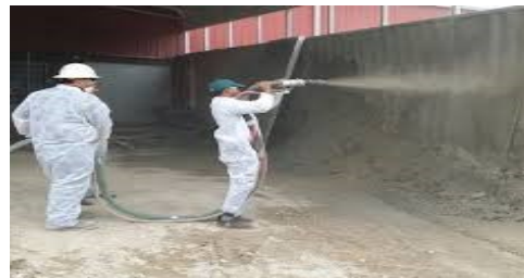
Fig. 2. Guniting