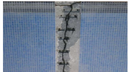
Fig. 4. Stitching

When the tensile strength of any structure needs to re-established across the major cracks, stitching as shown in Fig. 4 must be used. It involves the process of drilling the holes on both sides of the crack and grouting in U-shaped metal units with short legs (staples or stitching dogs).