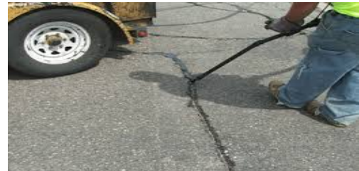
Fig. 3. Routing and Sealing