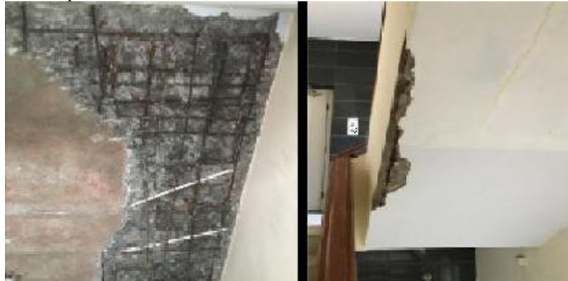
Spalling and Corrosion