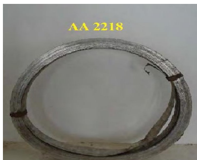
Figure 3. AA2218