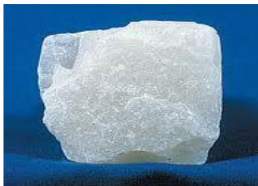
Figure 1. Talc

insoluble in water and in weak acids and alkalis. Although talc has a marked affinity for certain organic chemicals, it generally has very little chemical reactivity. It is neither explosive nor flammable. Above 900°C, talc progressively loses its hydroxyl groups and above 1050°C, it re-crystallises into different forms of enstatite (anhydrous magnesium silicate). Talc's melting point is at 1500°C.