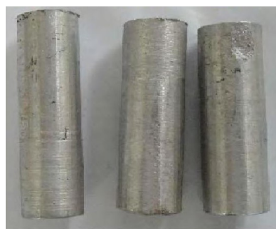
Figure 4. Specimen