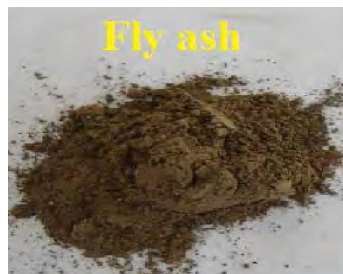
Figure 2. Flyash